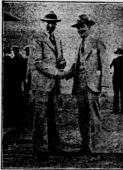
When Champion Meets Champion